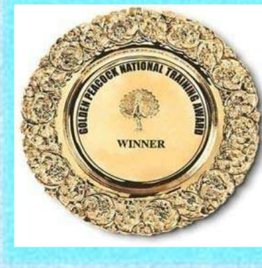
“Golden Peacock National Training Award” 1998