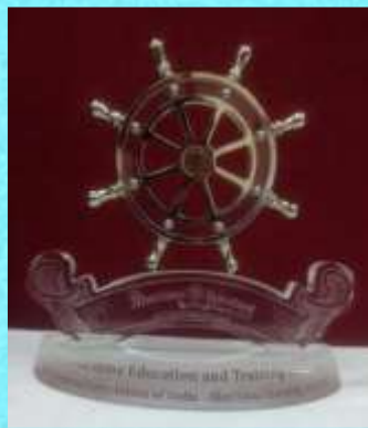
”The Maritime Education & Training” Award at Maritime Standard Awards 2017