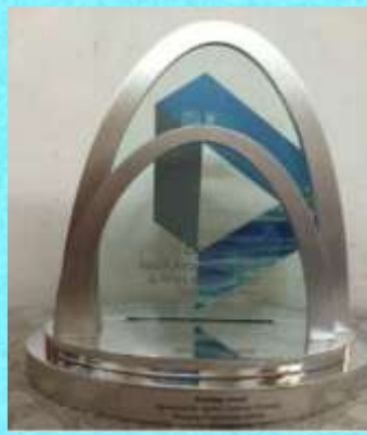
“Training Award” at Llyods List South Asia, Middle East and Africa Awards 2017