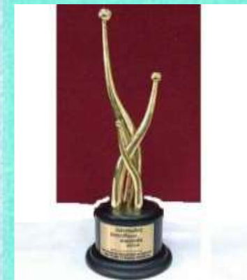
”Samudra Manthan” Award for ‘Institute of the Year’ 2016