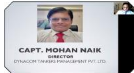
Contd. on page 3