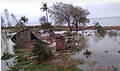
Urgent help needed. Millions of houses have been damaged by...