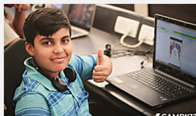
Coding Classes for kids, IIT/Harvard Mentors