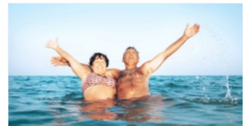
Good health for life