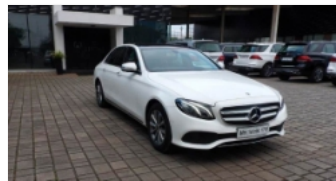
Your Dream Star is Just Around the Corner